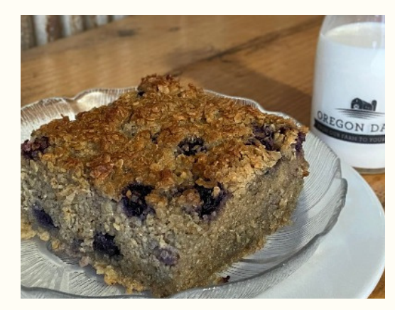
Old Fashioned Cooked Oatmeal ..... $4.99

Ask your server about our Flavor of the Month!